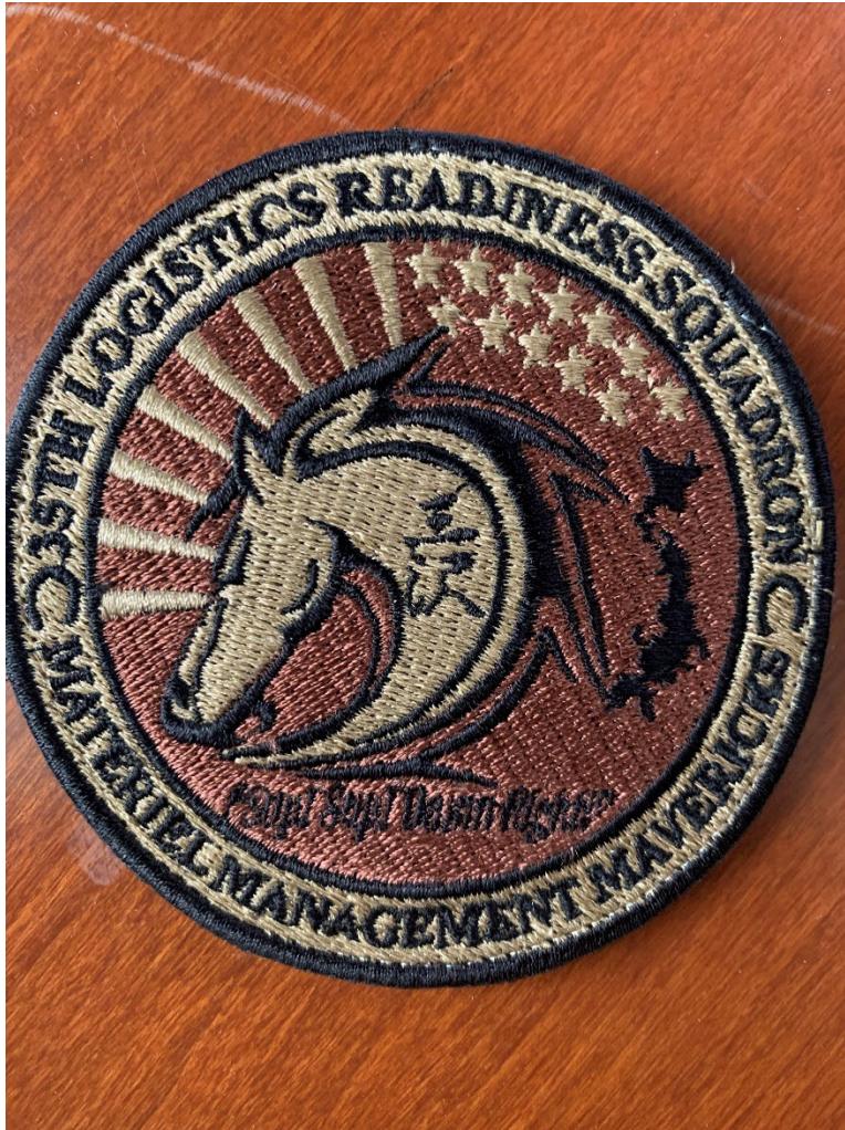
LRS MORALE PATCH