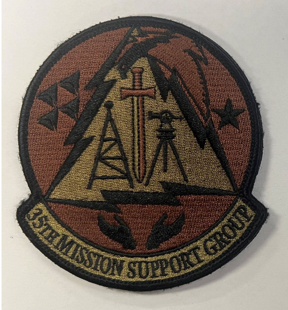
MSG MORALE PATCH #2/2