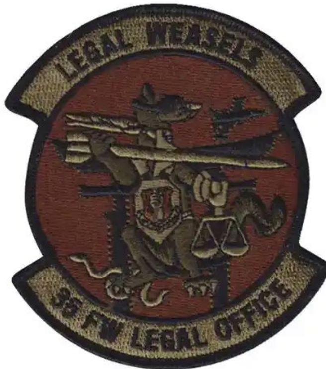
JA MORALE PATCH