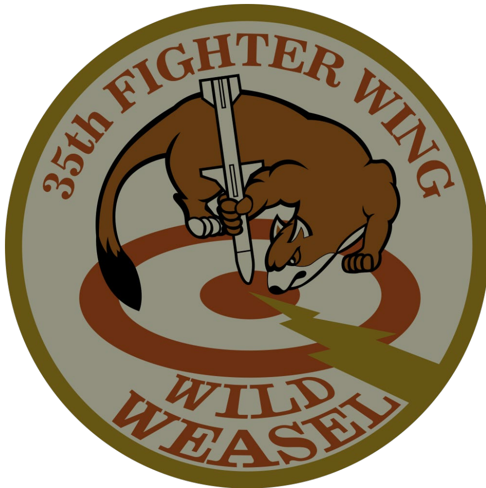
35 FIGHTER WING MORALE PATCH