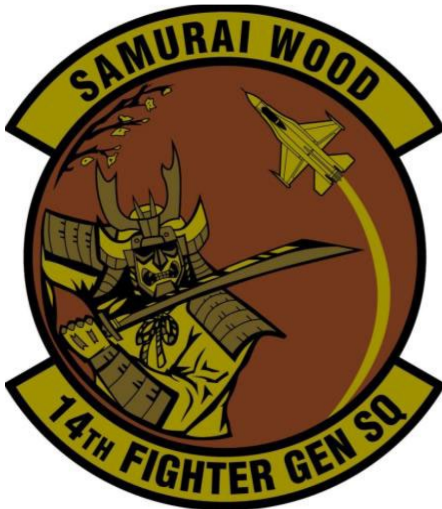
14 FGS MORALE PATCH