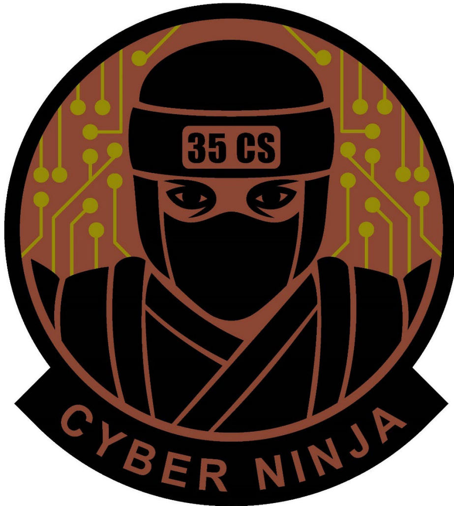
CS MORALE PATCH