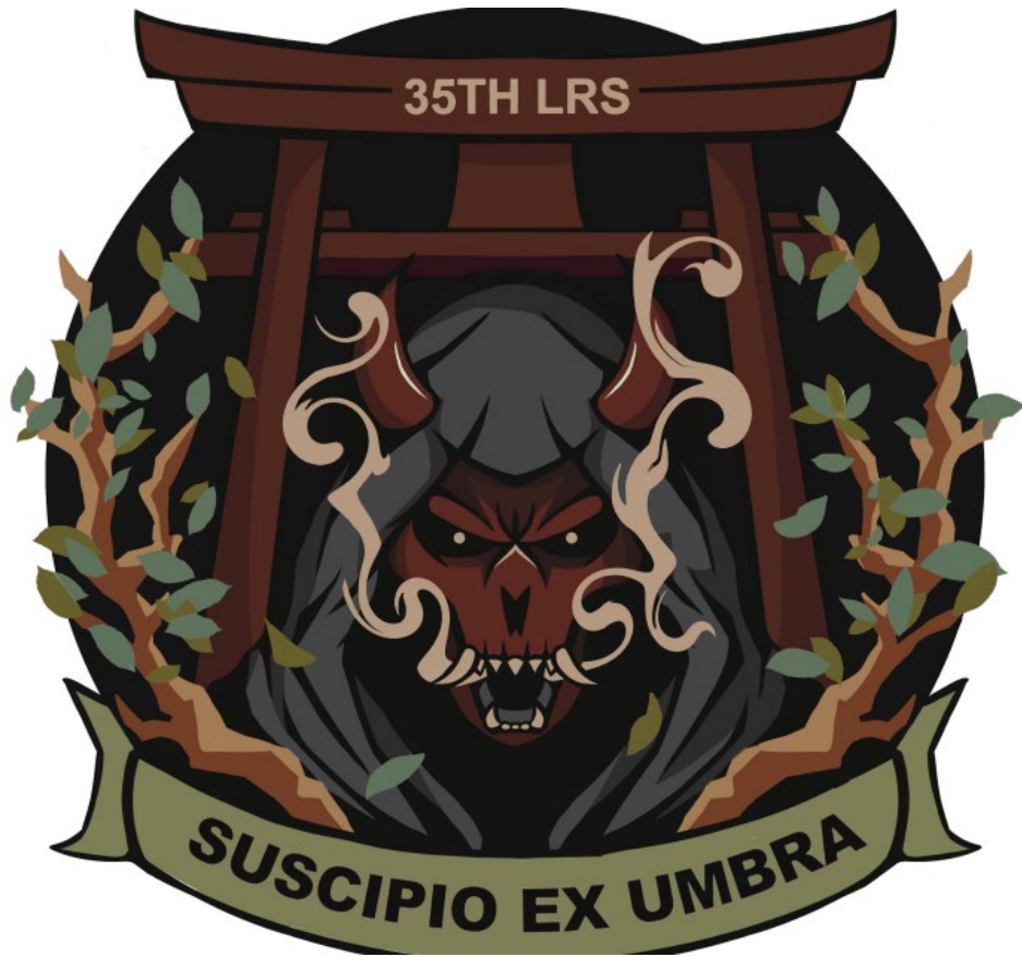
LRS MORALE PATCH