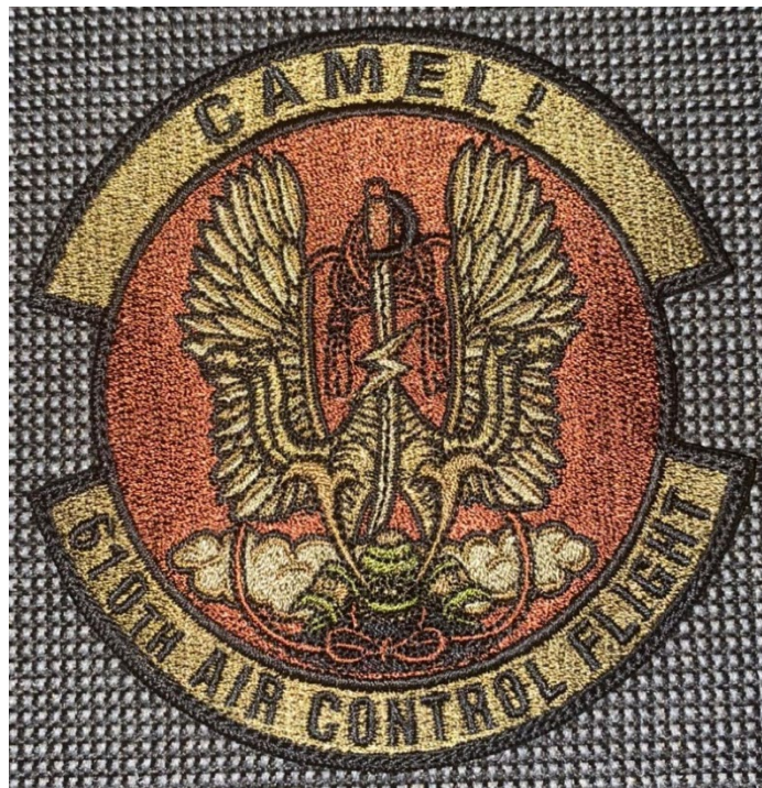
610 ACF MORALE PATCH