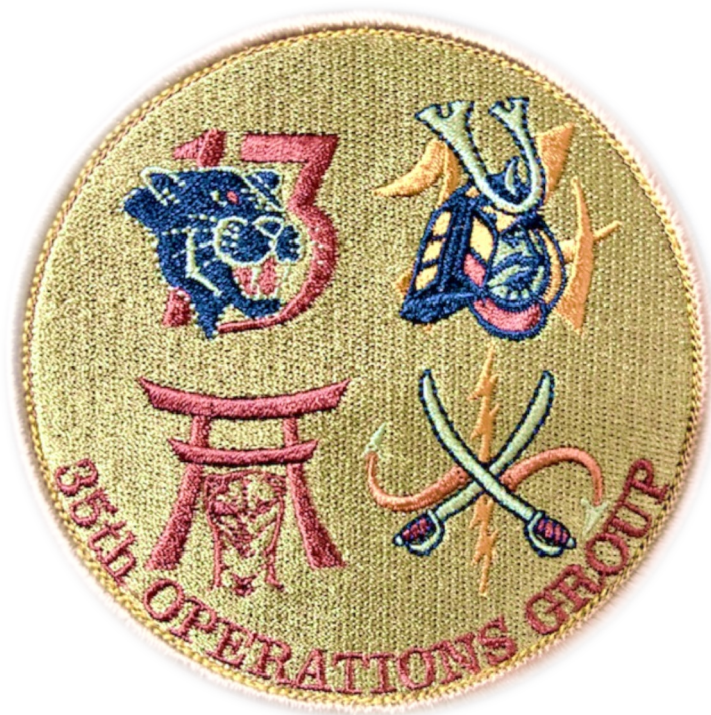
OG MORALE PATCH