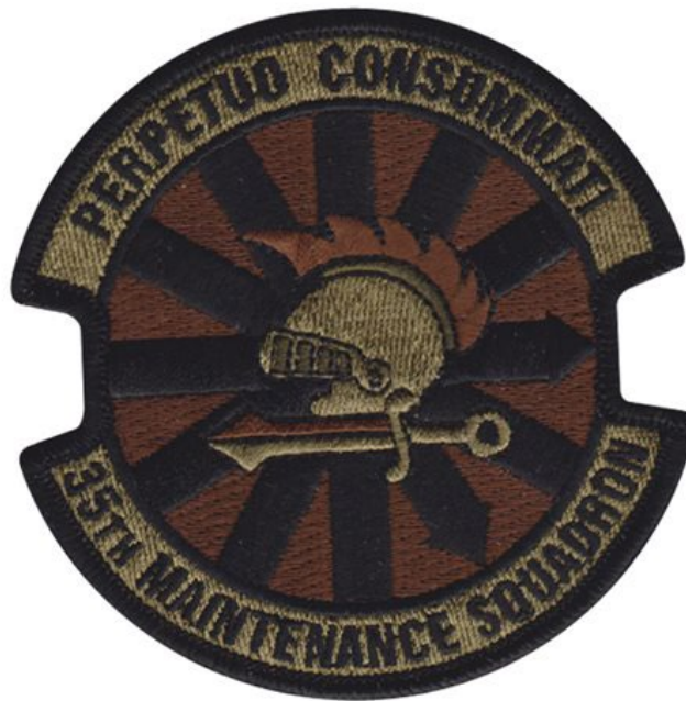
MXS MORALE PATCH