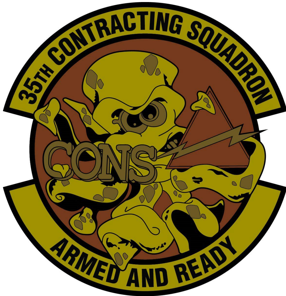
CONS SQ MORALE PATCH